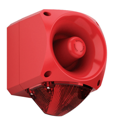
Applications - Fire alarm; conveyors; process control alarm; cranes; moving machinery; general signalling; marine